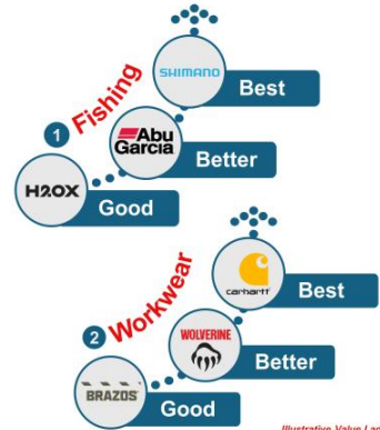
Illustrative Value Ladder